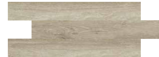
6611 Olmo 8"x59" Soft Touch Natural