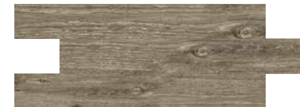
6611 Cedro 8"x59" Soft Touch Natural