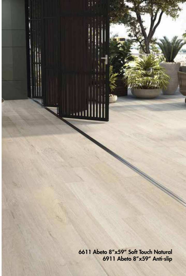
6611 Abeto 8"x59" Soft Touch Natural 6911 Abeto 8"x59" Anti-slip