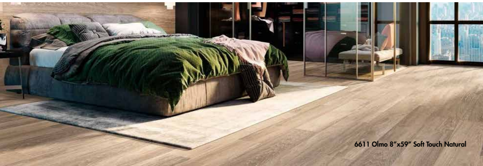
6611 Olmo 8"x59" Soft Touch Natural