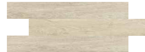
6611 Abeto 8"x59" Soft Touch Natural