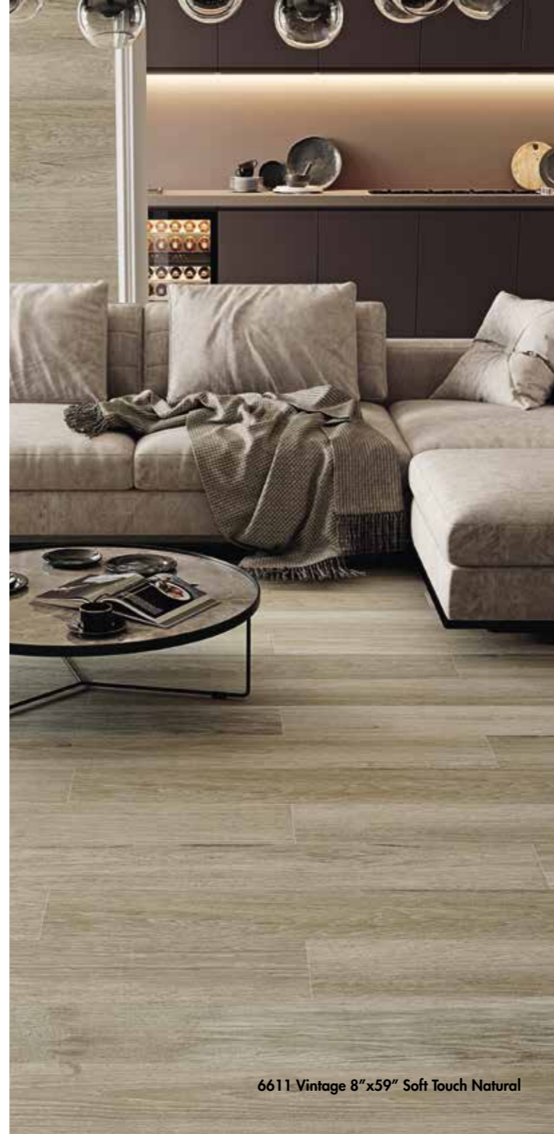
6611 Vintage 8"x59" Soft Touch Natural