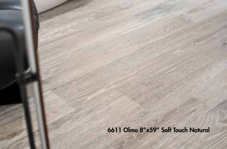
6611 Olmo 8"x59" Soft Touch Natural